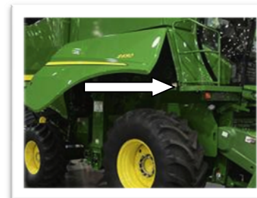
Combine (under side panel)