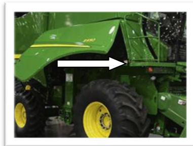
Combine (under side panel)