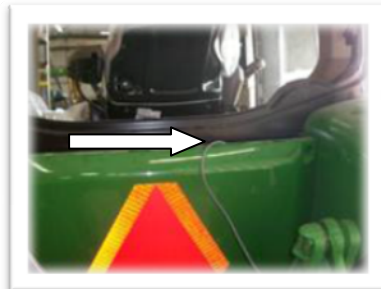
Tractor (behind rear cab cover)